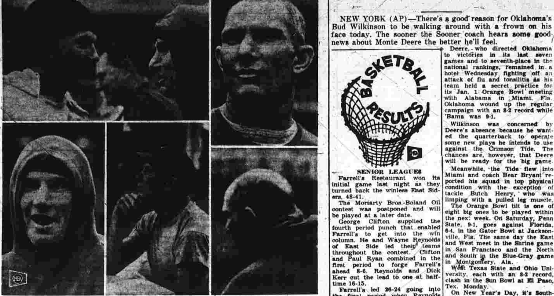
BEHIND the facade of Texas drawl and whimsical self-deprecation, Y. A. Tittle is the most animated of the Giants. These pictures, taken as the New York team prepared for the National Football League championship game against the Green Bay Packers at Yankee Stadium Dec. 30, give a good close-up of the amazing 6-year-old quarterback. Upper left, Tittle discusses pass pattern technique with Del Shofner, his favorite target.